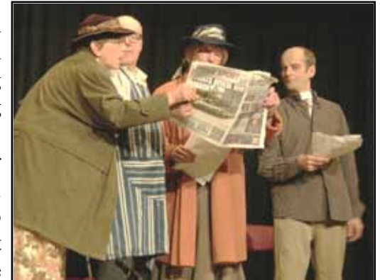
The shocking news that the Memorial Hall is to be turned into a Cabaret Club