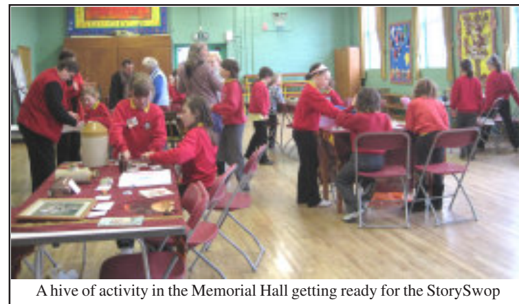
A hive of activity in the Memorial Hall getting ready for the StorySwop