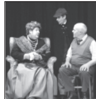
Moriarty in drag fools everyone, even Holmes and Dr Watson!